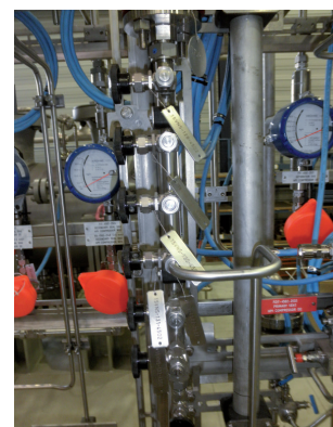
Nitrogen flow measurement with the H250 M40

Because the measuring instruments were supplied with screw process connections, the assembly time was shortened significantly and allowed a flexible, space-saving installation of the devices, in contrast to flange connections. The FOUNDATION™ fieldbus version design enabled direct integration into the end customer's communication network without additional power supply or converters.