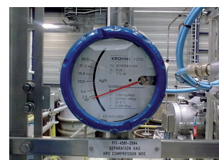
Signal converter of the H250 M40

For a natural gas transportation project in Queensland, Australia, a leading international supplier of infrastructure solutions manufactures compressors for the compressor stations. The compressors are designed to concentrate natural gas under pressure so that it can be transported. The manufacturer produces turn-key systems for this purpose, fits them with gas seals and equips the compressors with seal gas systems to seal the shafts.